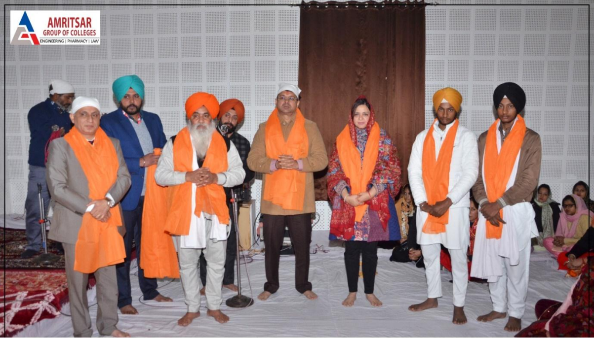
Shri Akhand Path Sahib Ji Bhog @ AGC