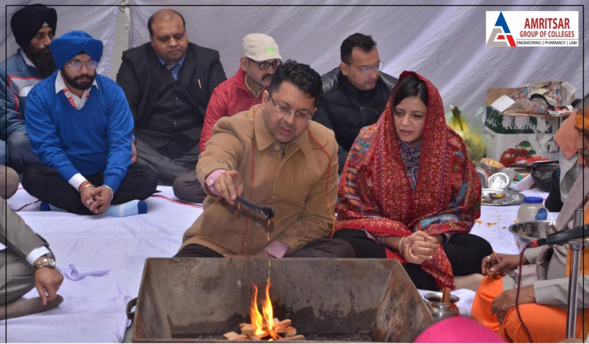
Hawan Yajna held at AGC