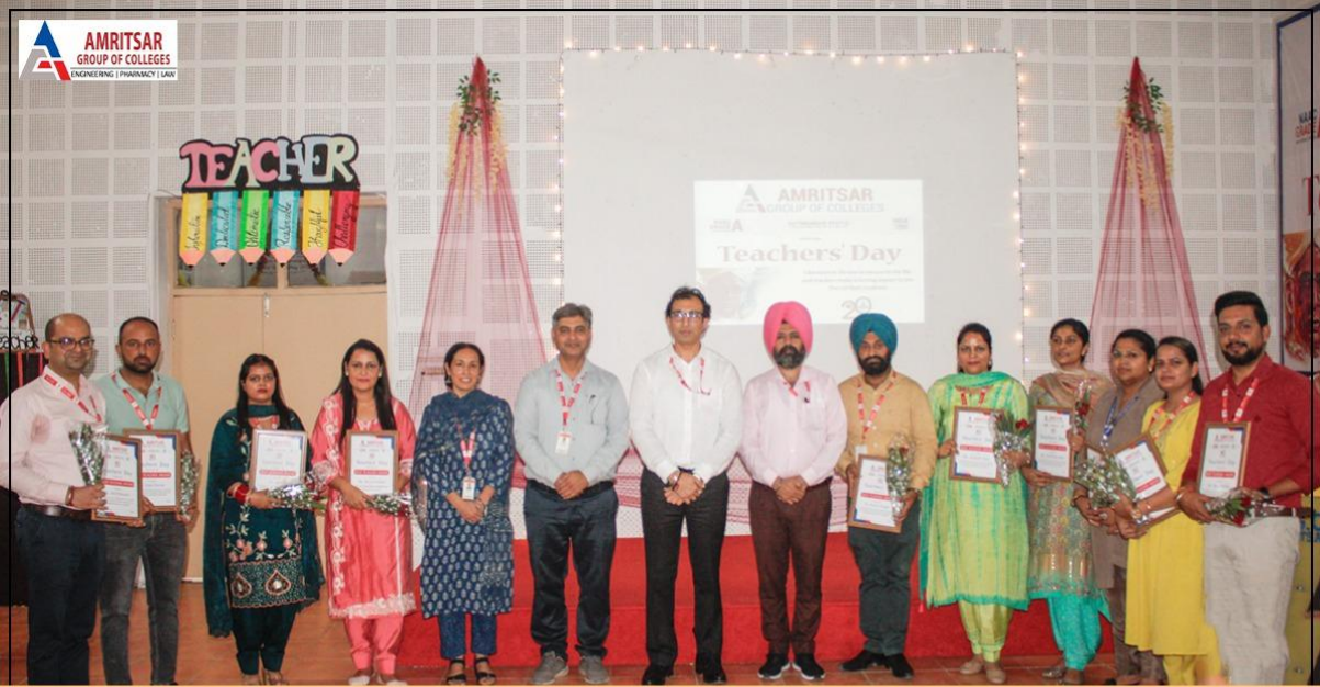
Teachers' Day Celebration @ AGC