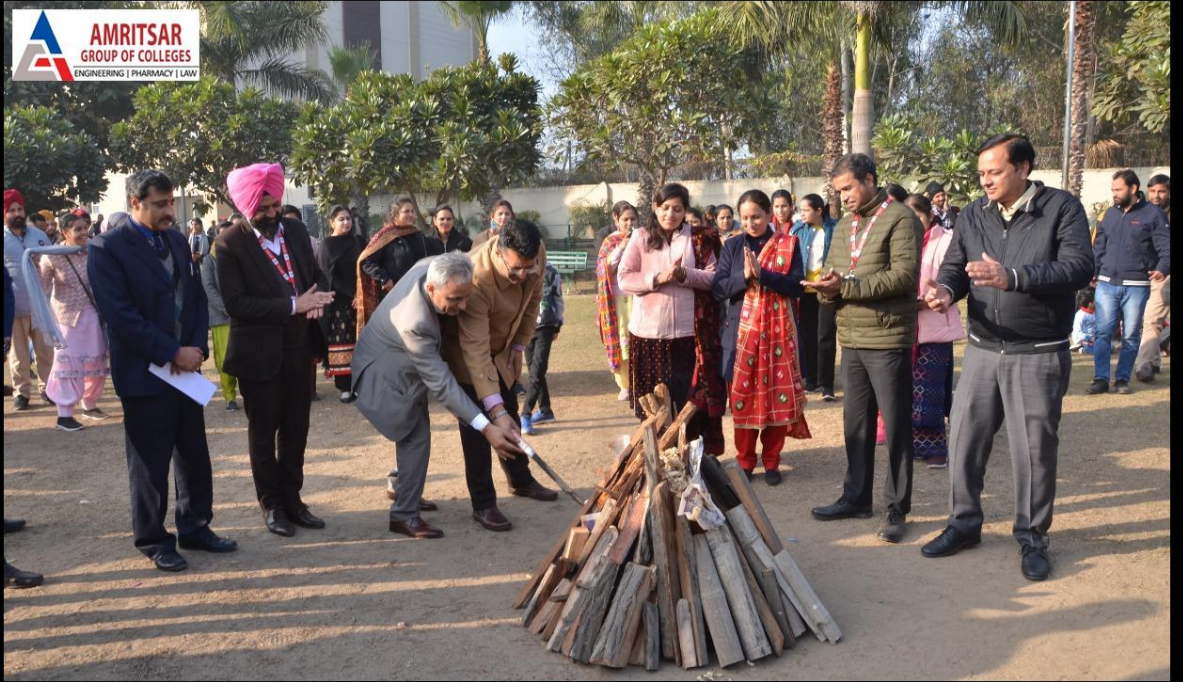
Lohri Celebration @AGC