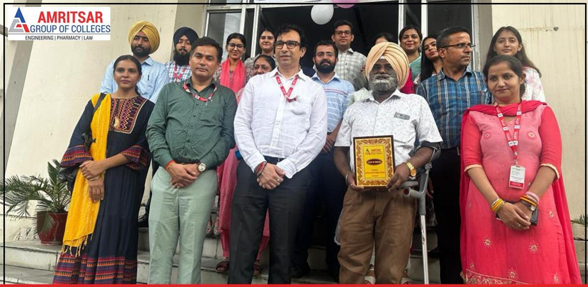
Seminar on "Pharmacist Strengthening Health System- ANGDAAN MAHADAN" By: Department of Pharmaceutical Sciences