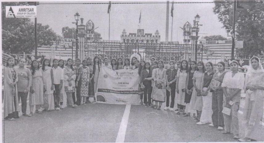
Raksha Bandhan celebration @ Wagha Border