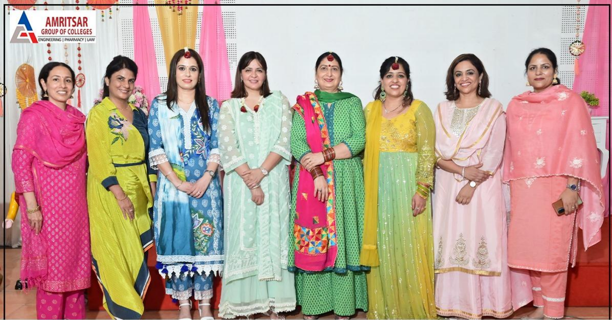
Teej Celebration @ AGC