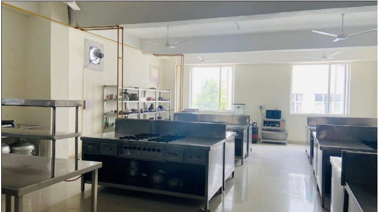
IN HOUSE RESTAURANT