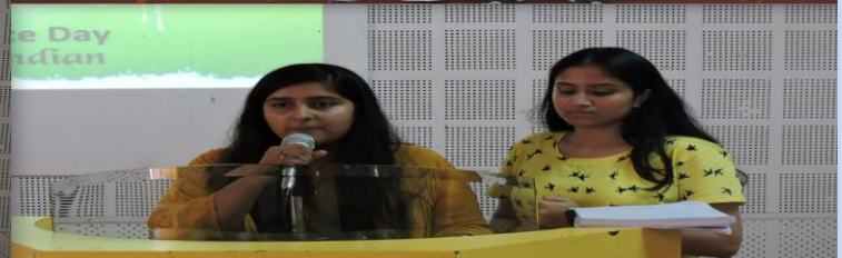
“Students celebrated 73 rd Independence Day by reciting the poems, giving inspirational speeches and by singing the patriotic songs”