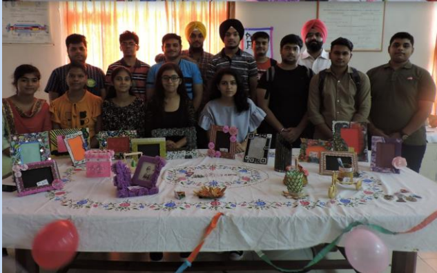
“Budding engineers exhibiting their skills in Junkyard”