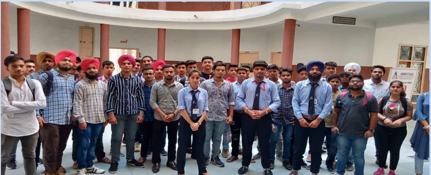
One Team of Senior Students familiarized the one group of new students with the Central Amenities of the College