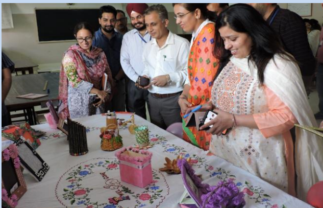
“Students made handmade photo frames and this stall was highly appreciated by the visiting authorities”