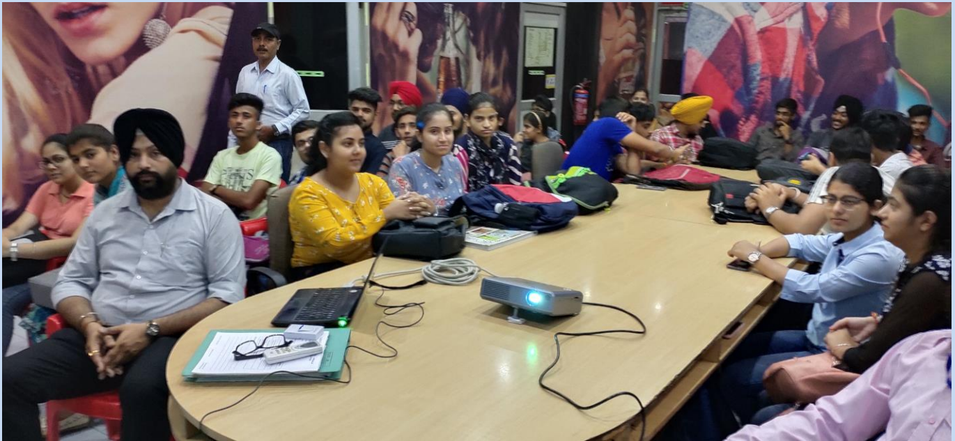
“Students Visited to Coca Cola Factory in different groups”