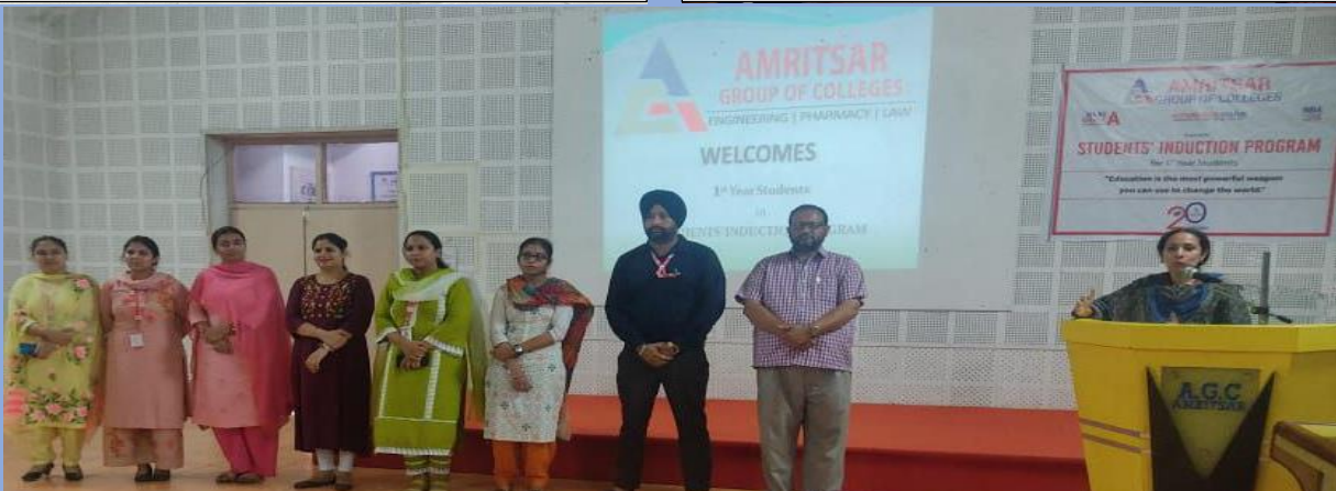
The new students are being familiarized with the faculty of Department of Applied Sciences