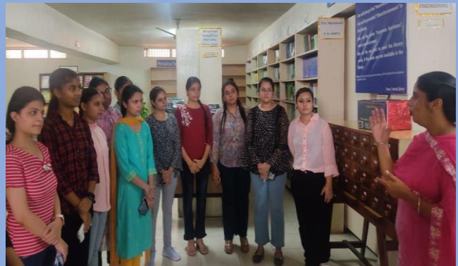
Visit in the Central Library