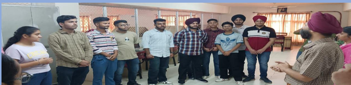
New students are being apprised about AGC Book Club