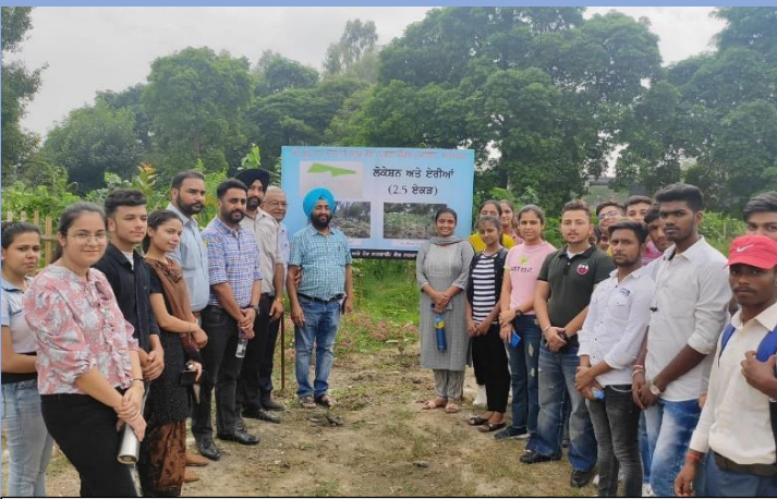
A visit to mini forest in Amritsar