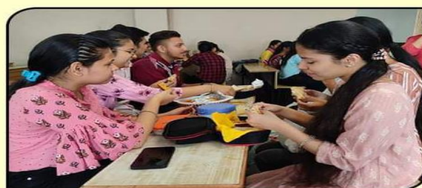
Few glimpses of Community Lunch