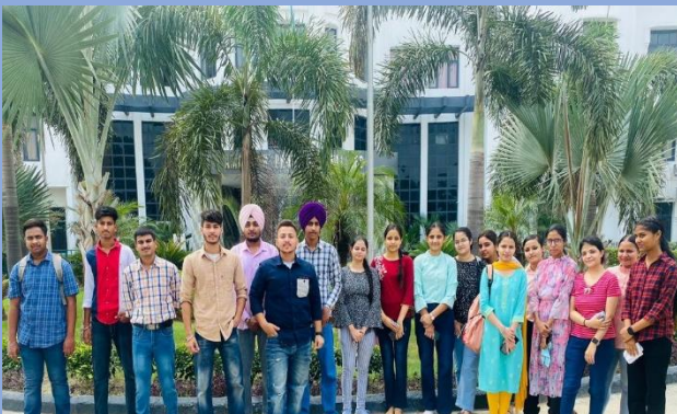
Students taking round of whole college in small groups