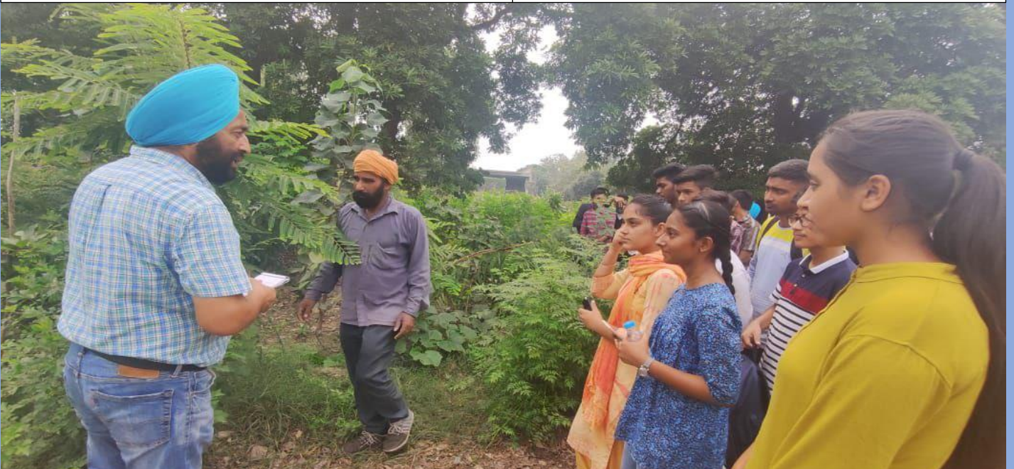
A visit to mini forest in Amritsar