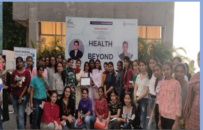
A visit at GNDU to attend a seminar