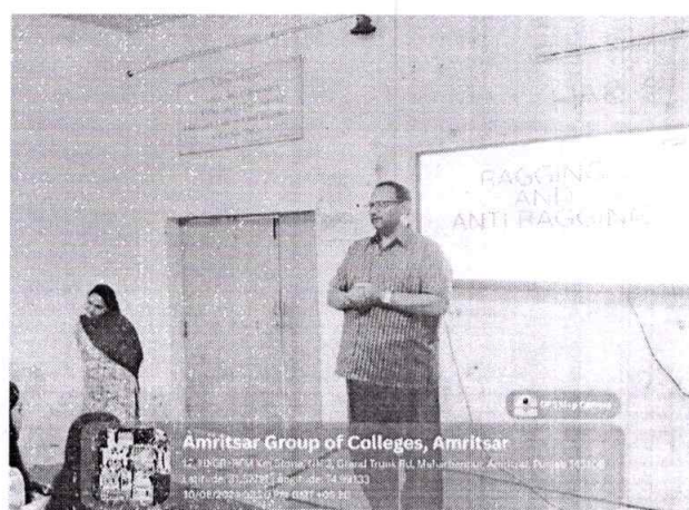
Glimpses of Awareness Session on Anti-Ragging in August 2024